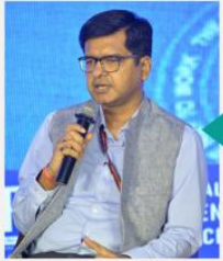
Shri Amit Nirmal DDG (Employment), Ministry of Labour & Employment, Government of India