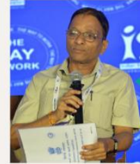
Virjesh Upadhyay Chairman, DTNBWED (Ministry of Labour & Employment, Government of India)